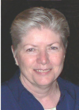
Library Friends President